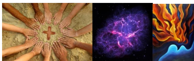
NASA and RCL

In March the 5 th session of the United Nations Environment Assembly in Nairobi made a resolution to end plastic pollution and to bring about a binding agreement by next year. Heads of state, ministers of environment and other representatives from 175 nations endorsed this landmark agreement that will address the full lifecycle of plastic from source to sea. It will be known as the plastics treaty. I've included a copy of the executive summary of the agreement with the written materials. We need to support such initiatives.