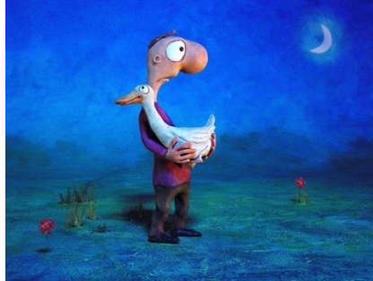
Leunig used with permission.

Seven billion of the nine billion tons of plastic produced from 1950-2017 has ended up in landfill or dumped. This has an effect on the environment and our health. Microplastics have been found in human placentas.