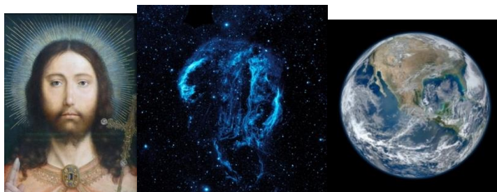
RCL & NASA

If we are made in God's image, we need to live out God's love for creation. God said it was good. But now it's not so good.