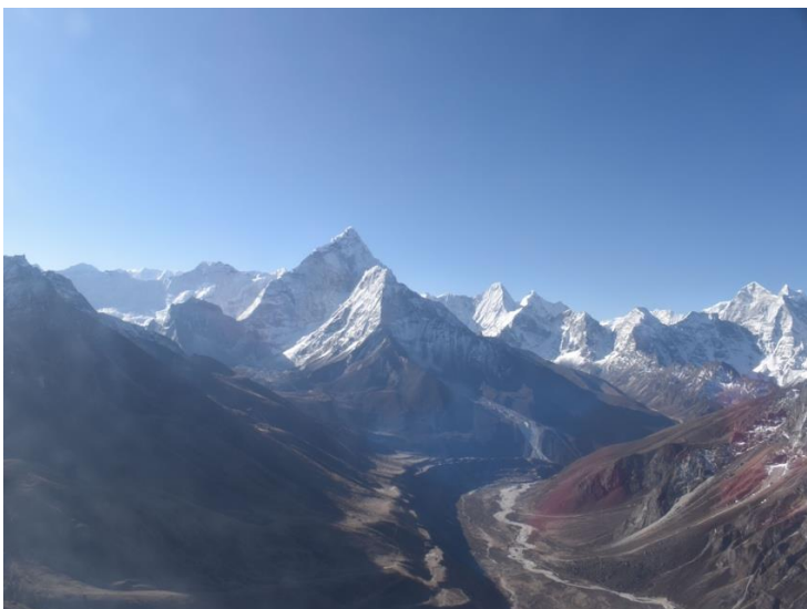
View of Everest Region from helicopter

We chatted for a while, then thanked each other and I walked on. Later on, it was God who found me on the mountain, not I who found God on that mountain and the experience completely transformed me.