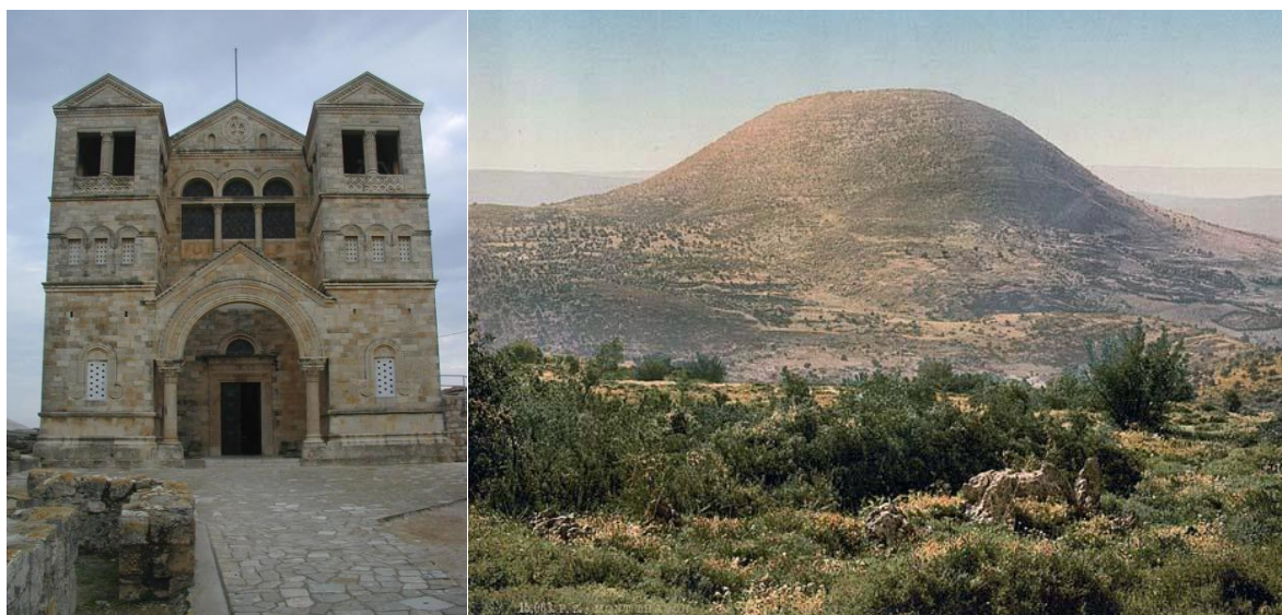
RCL – Church of the Transfiguration on top Mount Tabor and Mount Tabor

through an open window and climbed on the roof of the church. The view was amazing. But no spiritual experiences. It wasn't God's time. I wasn't ready.