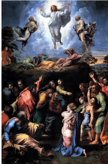
Rubens – RCL