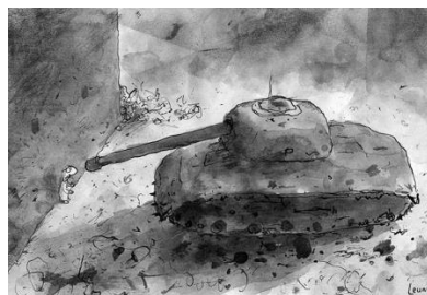
Leunig – used with permission.