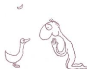
Leunig – used with permission.

It is reassuring to know that in the midst of challenges God offers us a banquet of choices and blessings that feed our soul, such as green pastures, and the overflowing cup of goodness and blessings and deep stillness within our soul.