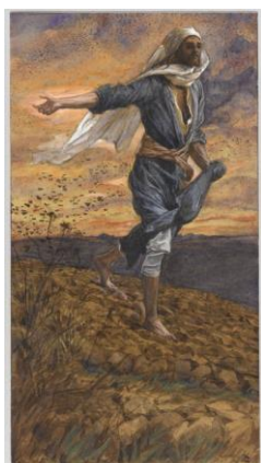
Tissot

In the name of the Father, the Son, and the Holy Spirit, amen.