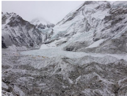
Gorak Shep village, near Everest

In the name of the Father, the Son and the Holy Spirit, amen