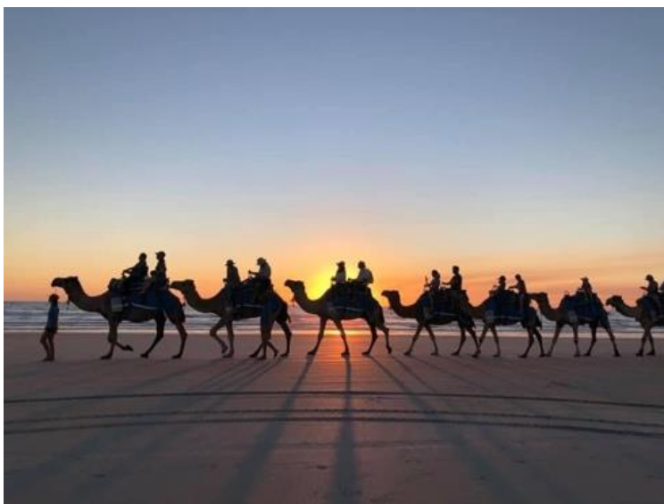
Used with permission.

I'd like to share some images with you and invite you to ponder and try to remember some of the places you've been in your lifetime that have left you feeling awe for God's beautiful creation.