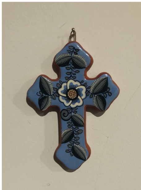
A Mexican Cross