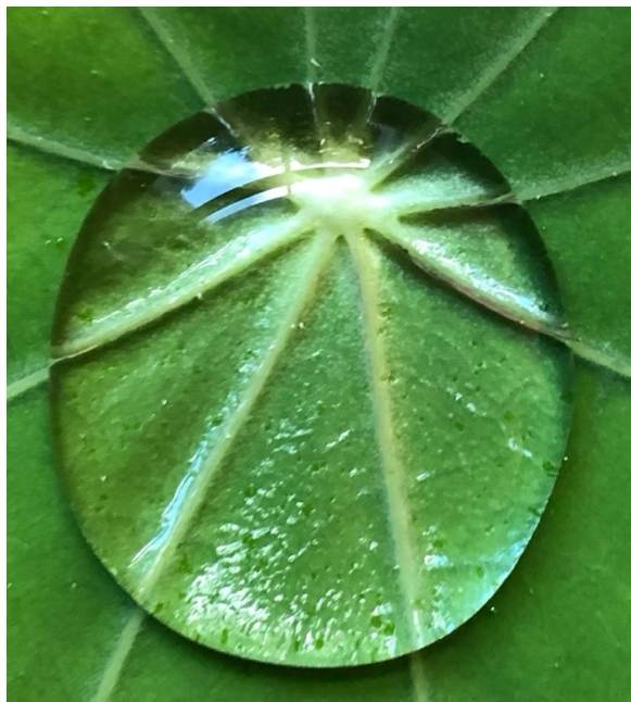
Photo of a droplet of water on a leaf, reflecting a window.

All around us is beauty in the smaller things of life. I invite you to pick up an autumn leaf and quietly contemplate the colours and structure of the leaf or look closely at a gumtree blossom, its structure and colours and whether a tiny creature has made its home in the midst of it. Find a magnifying glass and take a closer look with your children or grandchildren or greatgrandchildren. Nature is simply amazing. Notice the clouds, slowly moving across the sky and the light shining through them. Look out for droplets of water hanging from branches of a tree, just after a shower of rain and the light reflected or shining through the droplets. Covid-19 has forced us to slow down.