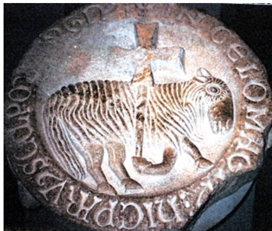
From Iona, Scotland

We are happy when we are pure in heart, for we will see God. When we sing the hymn 'Immortal Invisible', we know in our hearts what it means to have a pure heart. We want to see God, yet we know we will only have a glimpse of God in this life, a foretaste of seeing God, until one day we will see God in heaven, face to face. We have a reassuring image from Rev 7:17 of the Lamb at the centre of the throne being our shepherd, who will guide us to springs of the water of life and wipe away our tears.