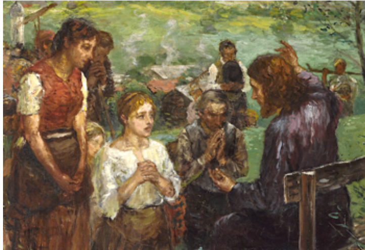
Sermon on the Mount – Fritz von Uhde, 2nd version