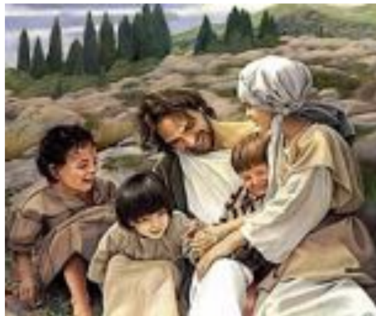
Jesus and the children

Of course there are times when it's not sensible to approach someone and make our peace with them and it's better to pray for the grace to hand that person over to God.