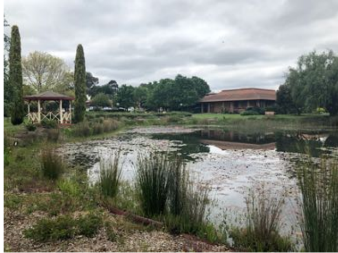
At Cherry Tree Retirement Village there are frogs and ducks in the artificial lake and a mother Wood duck hissed at us, when she was protecting her young ducklings