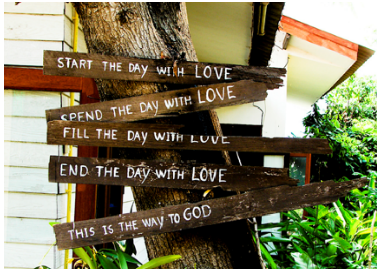
Wooden Sign, Doi Inthanon National Park, Thailand

The Holy Spirit moves within us, filling us with new hope in Jesus, where God's love in us moves us to reach out to our neighbour with love and compassion, despite our brokenness and fragility. If we wait until we are perfect and love ourselves, this will never happen. Paul spoke of us as being cracked vessels, filled with the wonder of the Holy Spirit and of there being no more condemnation for those in Christ Jesus. What happens is God loves others through us, where perfect love casts out all fears of not being good enough. We don't have to be perfect to love others. Our brokenness makes it possible for us to have empathy and understand others suffering. Our experience of forgiveness helps us understand and have compassion for others. We come to know the love of Jesus Christ in one another. God's love flows through us and blesses others. This great love transforms us and our neighbour where we are both drawn into God's love.