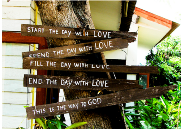
Wooden Sign, Doi Inthanon National Park, Thailand

Hymn: Be Still for the Presence of the Lord – Middlesbrough Baptist Church [2:53]