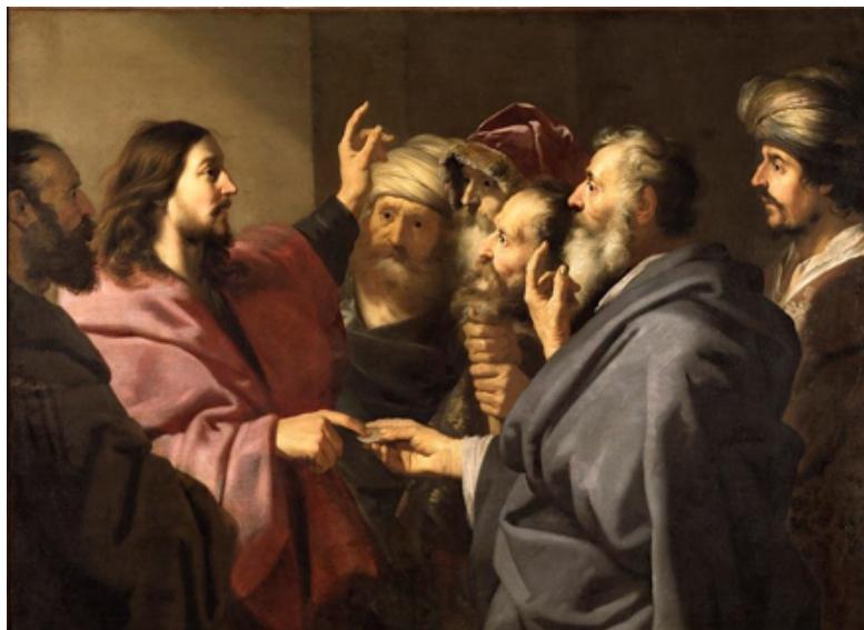
The Tribute Money, Jacob Backer, National Museum, Stockholm, Sweden

In the name of the Father, the Son and the Holy Spirit, amen