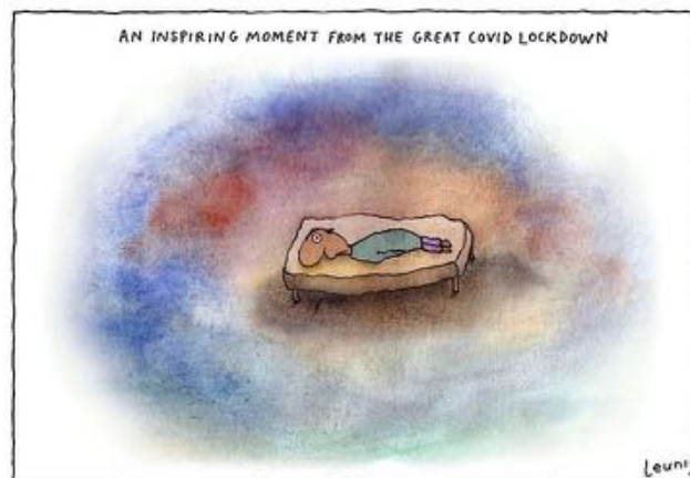
By Leunig. Used with permission.

Some days we may feel like this. When I saw this cartoon, I reflected on what's been sustaining me through lockdown. It's been family and friends, reading and living the gospel each day and praying on it and preparing the worship materials. Exercising daily and getting enough sleep. Writing up a to do list each morning when I pray and ticking off each item as I do it. It can be to call someone, do the worship or walk the dog or cook dinner or clean up something. It's good to look back on the day as productive, even if its simple tasks.