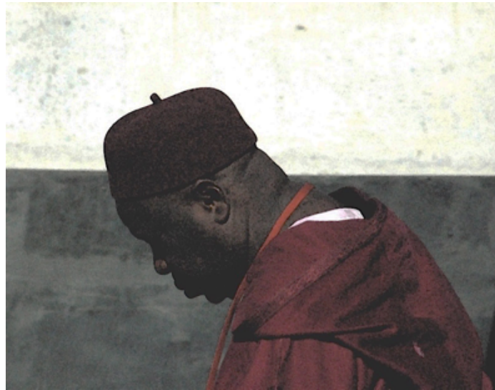
African Bishop Praying

I wonder what God gives us? Eternal life, spiritual food for the journey, love, the Holy Spirit, creation, a purpose, spiritual gifts, a call, family, friends, food, faith, hope and joy. The list is endless. In return we give God our life, our heart and soul. We are not called to have a wishy-washy faith. We are like the youth leaders. Called to grow into Redwood forests, the community of God, the body of Christ, the face of Christ, all this and more in the world and this requires a strong and constant faith with deep roots in Christ. We give of our self to God so we may find ourself in God.