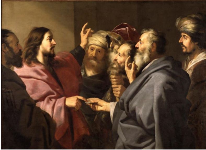
The Tribute Money, Jacob Backer, National Museum, Stockholm, Sweden