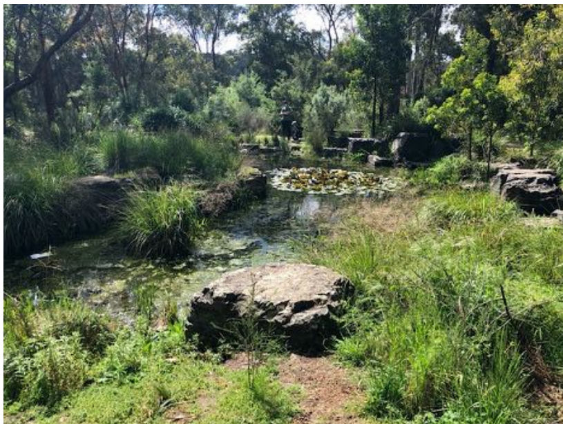
Waterlily pond in Yarran Dheran Nature Reserve

Sunday 18 th October 2020 – Pentecost 20