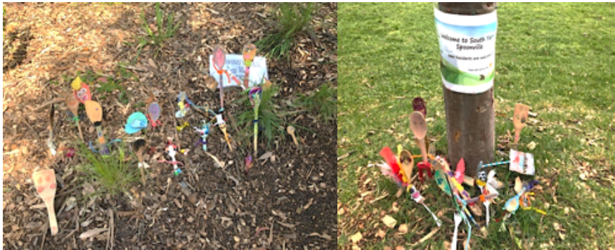
Spoonville families found at a park connected with Antonio Park, Mitcham and on the other side of town in a park in South Yarra