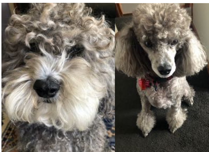
Rev Tina, for Mountview Uniting Church

The following link is to the 'Worship' page on our website, from where other resources may be accessed: