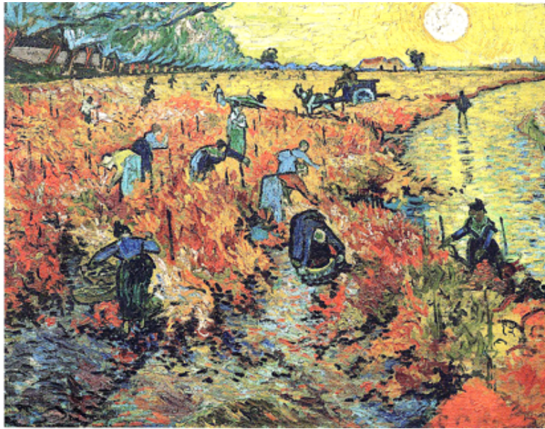
The Red Vineyard, Vincent van Gogh, Pushkin Museum, Moscow, Russia

In the name of the Father, the Son and the Holy Spirit, amen