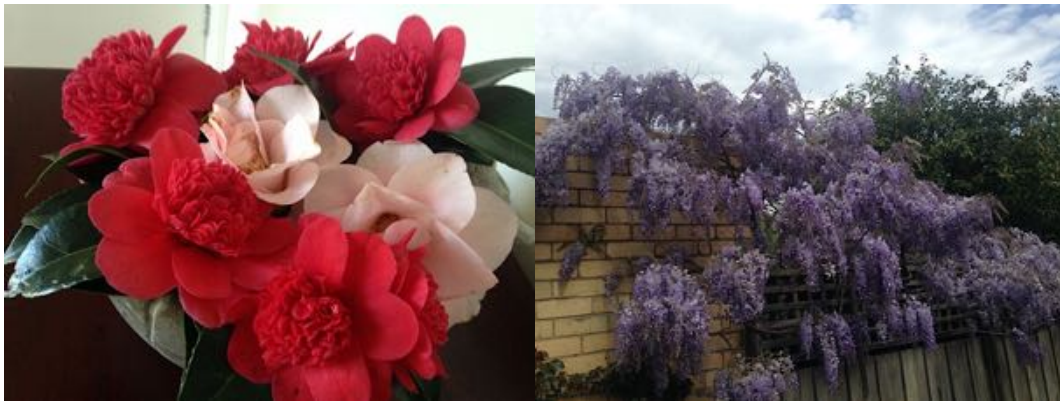
Flowers from the garden of Jill and Des

Nothing stays the same, and we look forward to each new day, and the possibilities that it may bring.