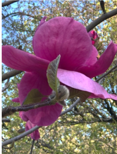
Giant Magnolia from National Rhododendron Gardens