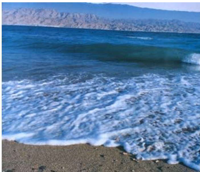
The Red Sea

Try to imagine what it was like for Moses and the Israelites on their pilgrimage to the land God had promised them. The Egyptians were after them to kill them or bring them back to Egypt, the place they escaped from, where they'd lived in oppression. They didn't want to go back. To return would mean death or continuous spiritual struggle and battle to survive. The story is of them being led by an angel of God, where a pillar of cloud was behind them and in front of them. Light came from this pillar in the darkness of the night, lighting their way.