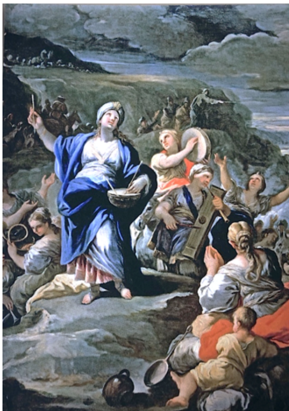
Miriam, Moses sister, and the Israelites Celebrating after crossing the Red Sea