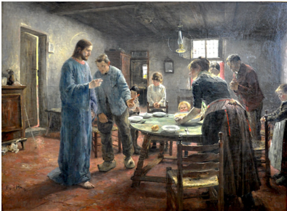
The Mealtime Prayer – Fritz Von Uhne