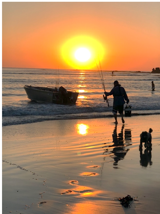
Fishing at Dawn – Aireys Inlet

I spent most days fishing, when my family lived on lighthouses. On Gabo Island I'd sit on the jetty and fish using a hand line. The water was so clear I could see the fish biting the hook. Sometimes they were so big I wasn't strong enough to pull them up onto the jetty and I had to unwind the line and climb down onto the rocks and pull them in that way (I was only eight). I discovered fish were smart.