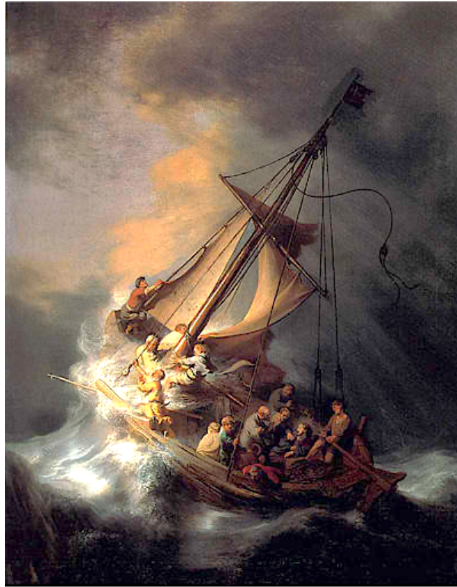
Christ in the Storm on the Sea of Galilee by Rembrandt