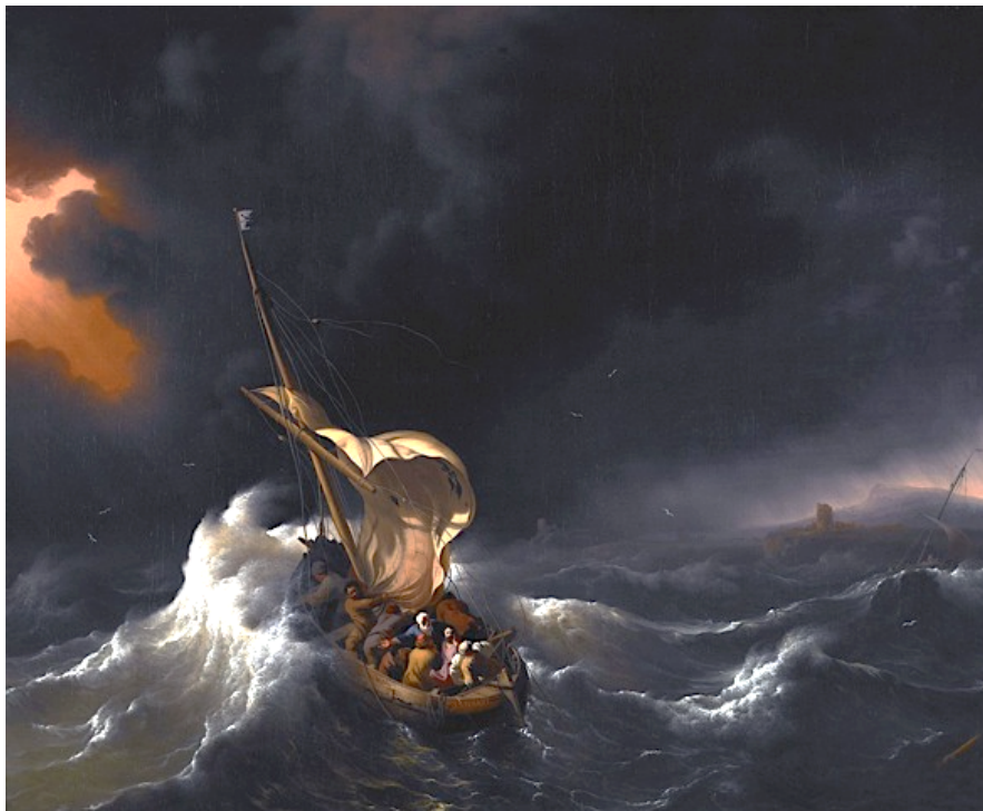
Nature can be wild and untamed