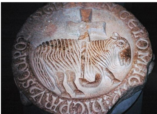
Museum, on Iona, Scotland.