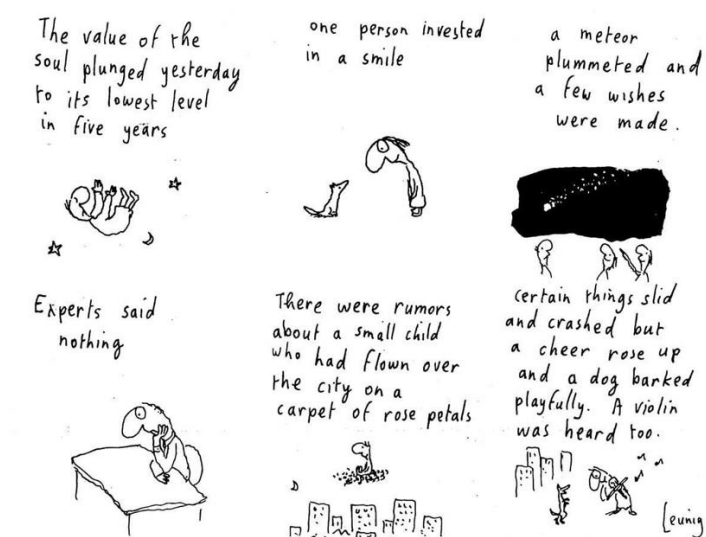
Leunig. Used with permission.