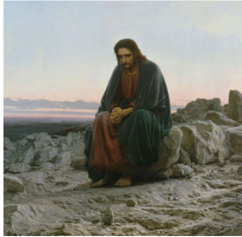
Christ in the Wilderness, Ivan Kramskoi, Moscow, Russia

In the name of the Father, the Son and the Holy Spirit, amen