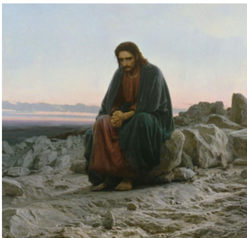
Christ in the Wilderness, Ivan Kramskoi, Moscow, Russia