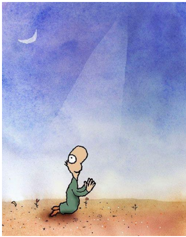
Leunig - used with permission