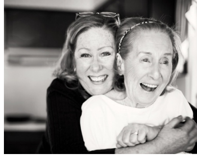
RCL – Love and Happiness