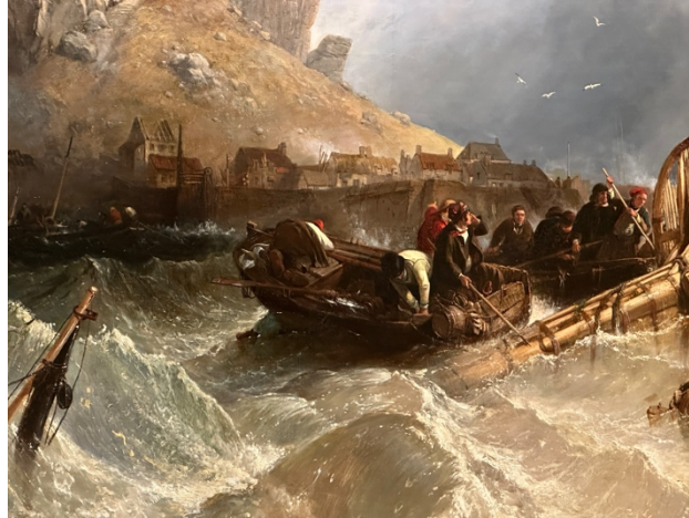
Old Master Painting

In the name of the Father, the Son, and the Holy Spirit, amen.