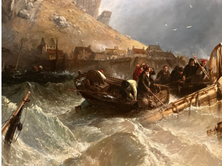
Old Master painting

People are remembered for their love. Congregations are remembered for their love.