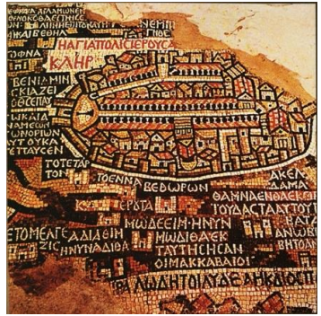
Ancient mosaic of Jerusalem

There is another reading for today from Isaiah. Thousands of years before the gospel of John, the metaphor of a wedding was used to describe the relationship of God with His people. The people had been in exile in a country far from home for a very long time and had returned to Israel and Jerusalem, but they were struggling to make a new beginning. Everything had changed. Things were not the same and they couldn't go back to living the way they used to live.