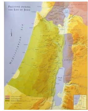
Map showing Jesus' travels

You may be wondering what lighthouses have to do with weddings and the miracle at Cana. Cana was near the Sea of Galilee, not far from Jesus' home in Nazareth. (Up the top of the map)