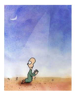
Leunig - Used with Permission