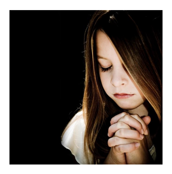
Young at Heart How do we show our love for one another?

<sup>31</sup> When he had gone out, Jesus said, 'Now the Son of Man has been glorified, and God has been glorified in him. <sup>32</sup> If God has been glorified in him, <sup>[a]</sup> God will also glorify him in himself and will glorify him at once. <sup>33</sup> Little children, I am with you only a little longer. You will look for me; and as I said to the Jews so now I say to you, "Where I am going, you cannot come." <sup>34</sup> I give you a new commandment, that you love one another. Just as I have loved you, you also should love one another. <sup>35</sup> By this everyone will know that you are my disciples, if you have love for one another.' ©NRSV National Council of the Churches of Christ in the USA. Used by permission. All rights reserved worldwide.