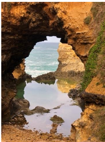
The Grotto – Great Ocean Road