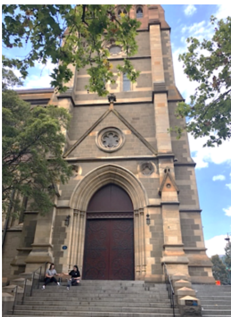
St Paul's Cathedral's doors were locked!

In the name of the Father, the Son and the Holy Spirit, amen