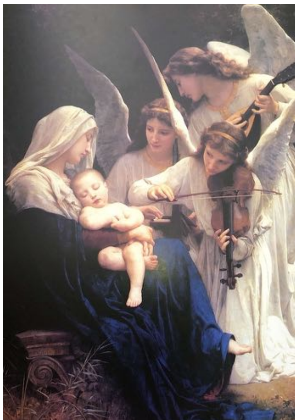
Song of the Angels by William Bouguereau