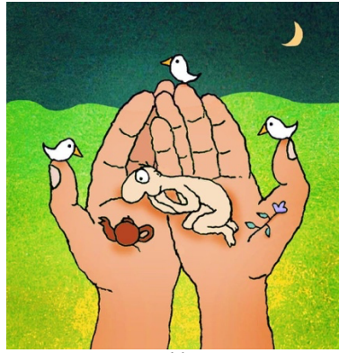
Leunig. Used by permission

Coming out of a long period of lockdown where many people experienced depression, anxiety, worry and fears, isn't easy. Many people may be still feeling tentative and cautious.