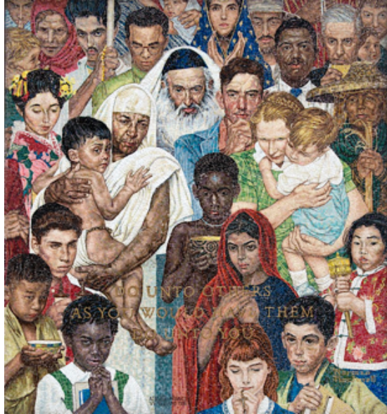
Wall of Praise – Based upon Norman Rockwell's Golden Rule Thanks-Giving Square, Dallas, TX