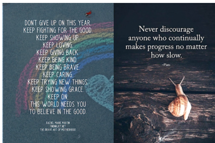
From Contemplative Monk

It fills me with hope. Try Googling for more, or enter 'The Blessing' in the YouTube Search box.