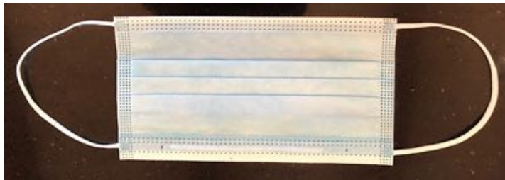
An image that speaks of 2020

This week we remember images and blessings from 2020. Consider what has been the highlight of the year for you, that you would like to give thanks to the Lord for and that you will look back on as a blessing.