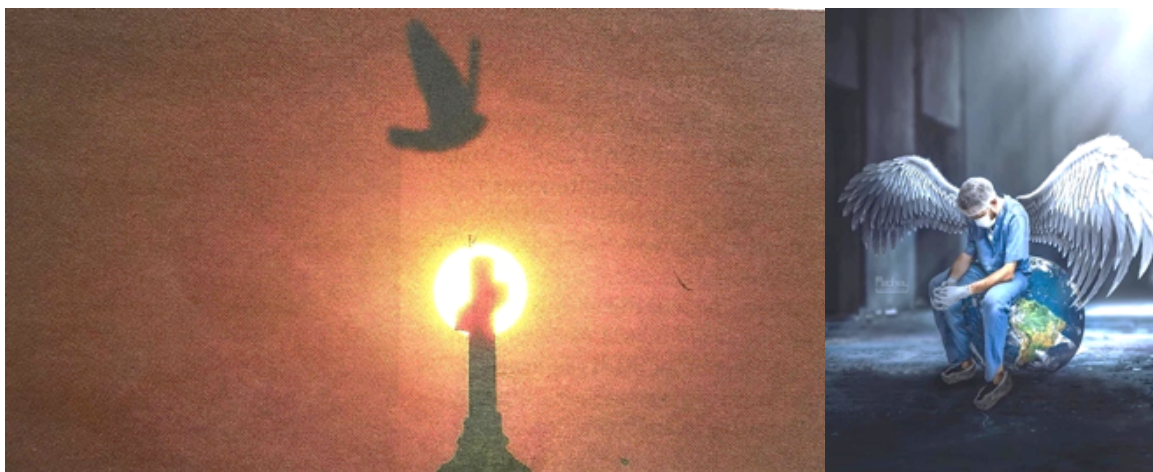
An image from the bushfires

We had the bushfires over summer, and they were followed by outbreaks of Covid-19. This image speaks to us about smoke and the danger of contracting Covid-19. It speaks of fear, asthma, death, loss and grief. Yet, we are not defeated. Our responses were of courage, faith, hope, compassion, caring, and love for our neighbour.