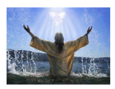
Hymn 418 She sits like a bird. St Chad. Ladybarn 2020 https://youtu.be/9iYgOWT1AKA?si=weY7ii7xTFpvjhuc