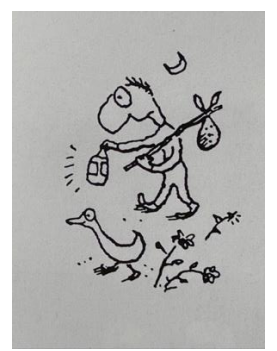
Leunig, used with permission.

The hymn: O little town of Bethlehem, was written long before a large wall was built around the church in Bethlehem that stands on top of the cave Jesus is said to have been born. There are beautiful words in the hymn of a light in the darkness where hope meets fear and angels keep their watch of wondering love.