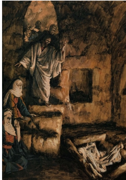
In the name of the Father, the Son and the Holy Spirit, amen.

One of my greatest fears is being buried alive and waking up in a coffin. I know its illogical, but I have a great imagination and have had lots of near misses; trampled by horses, falling off mountains 5000m up, bikes, trees, storms, an octopus, snakes and more. I figure I will go home to God when it's my time. But, I'm not sure what to do about this fear of being buried alive. Perhaps tell my kids to make sure I'm dead, wait ten days, then bury me with a fully charged mobile phone. I hope there's reception down there. My fears began when I heard the story about a Chinese lady in her eighties. Her family thought she was dead. Seven days later she woke up during the burial rituals and got up and made dinner. I figure that would be my luck, having had so many close calls.